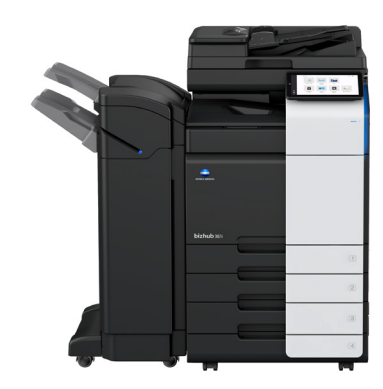
bizhub i-Series 361i