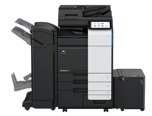
bizhub i-Series 361i