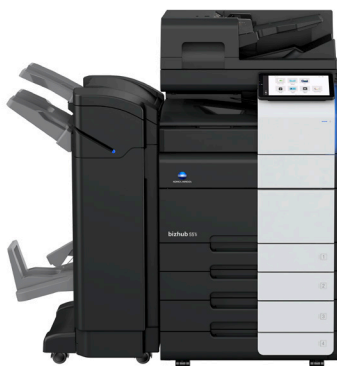
bizhub i-Series 551i