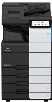
bizhub i-Series 451i