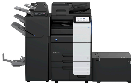
bizhub i-Series 651i