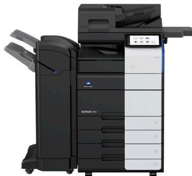
bizhub i-Series C551i