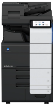
bizhub i-Series C451i