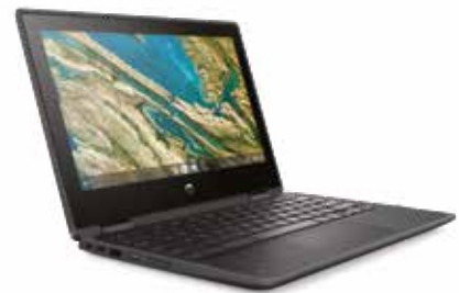
HP Chromebook x360 11 G3 Education Edition