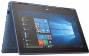
ProBook x360 11 G5 & G6 Education Edition

Visit hp.com/education for additional devices