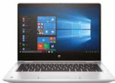
HP ProBook x360 435 G7