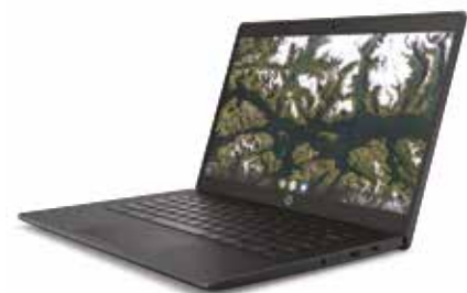
HP Chromebook 14 G6